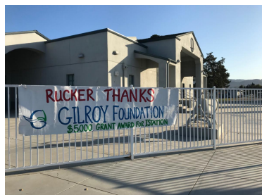
Rucker Elementary School