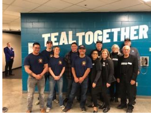
Oversight Committee members join First Responders for a "team" photo!